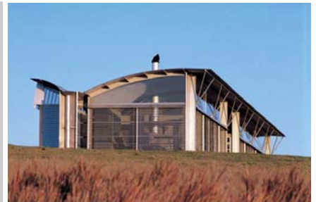
Magney House, Australia (1984)