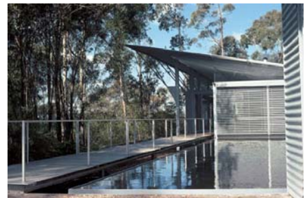
Simpson-Lee House, Australia (1994)