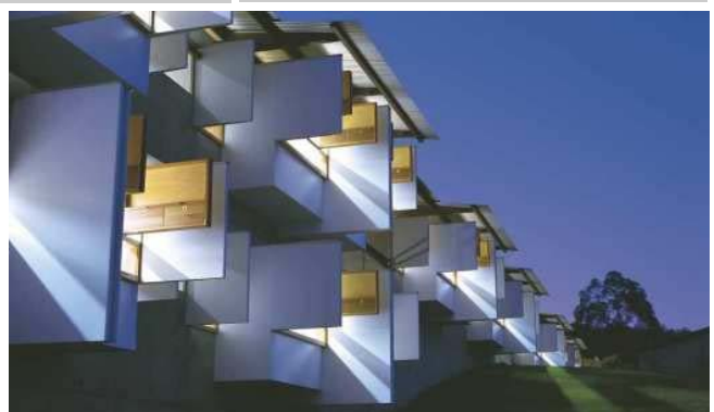
Arthur & Yvonne Boyd Center, Australia (1994)

As an experimental effort for SIA's Magazine, SIA Newsletter is set to publish the ARCHITECTURAL RESEARCH PAPER SERIES starting on the coming issue. Your thoughts and contributions are very welcome.